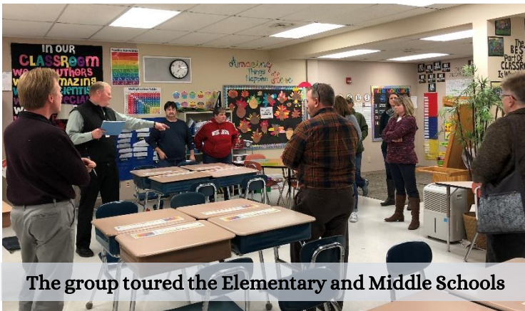
The group toured the Elementary and Middle Schools

Visit the District's website for all materials related to the facility planning process.